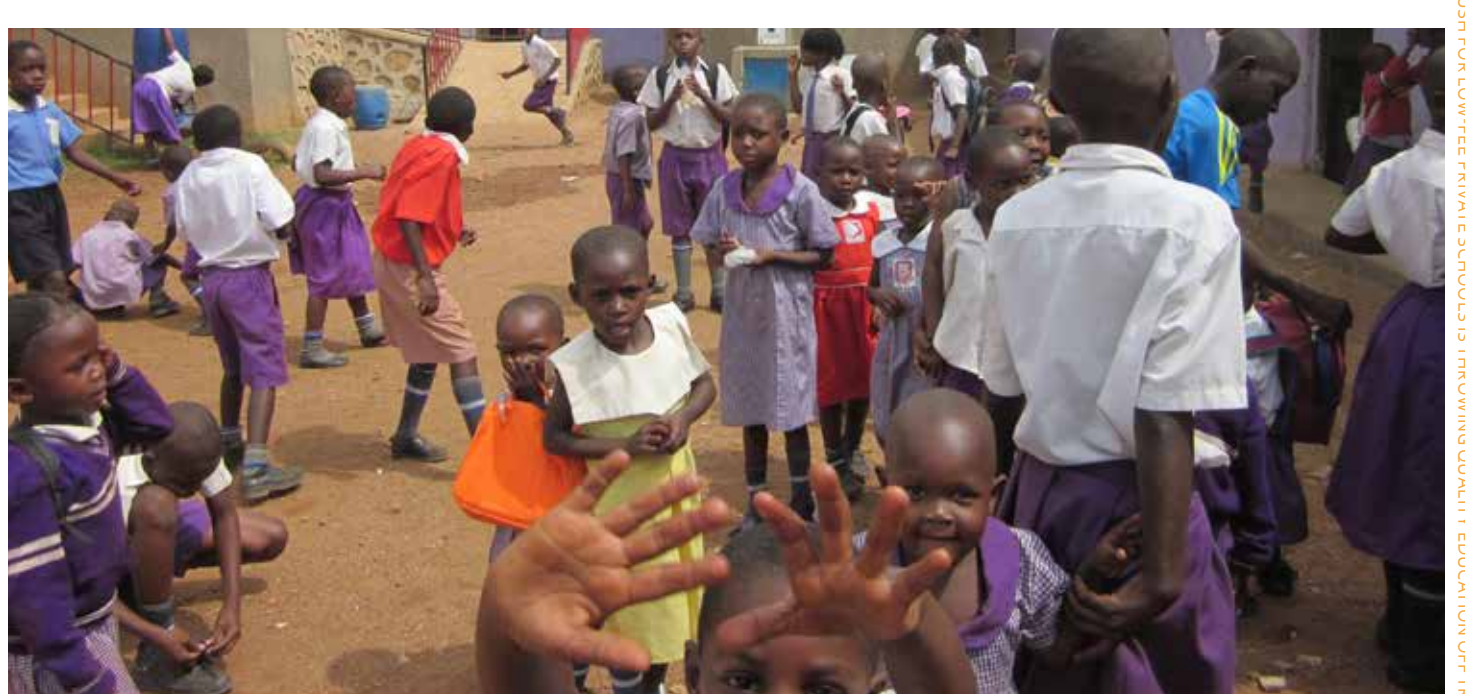
African Child Primary School (a low-fee primary school) in Nakamiro Zone, Bwaize informal settlement, Uganda.