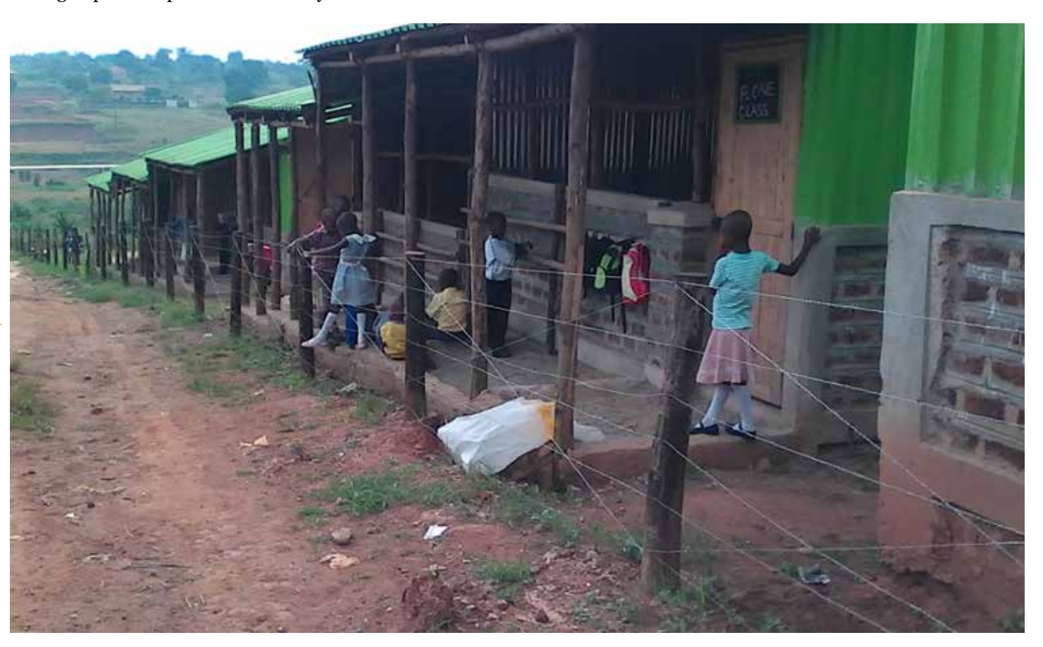
Pupils at a Bridge International Academy, Kawanda, Uganda.

Providing a quality education for every child is a significant challenge, and there are no quick fixes. Governments, institutions and donors must put aside ideology and short-term wins that undermine long-term success. They must join together now, working with civil society, to reinvigorate and rebuild strong public education systems that can deliver quality education for all.