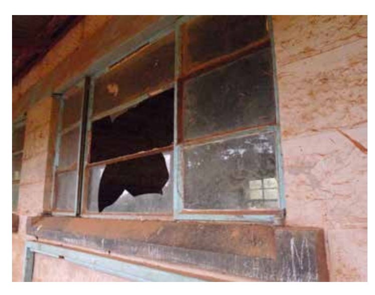
A broken classroom window at a low-fee private school in Tumu Tumu, Kenya.

Untrained teachers are not a problem solely in low-fee private schools, but the drive to minimise costs and achieve profit can create incentives to cut the cost of teacher training and teacher salaries. In Ghana, 2009 research showed that roughly half of teachers in government schools were untrained, but this figure rose to more than 90 percent of private school teachers in some districts. Data from the UNESCO Institute of Statistics shows that by 2015, only 55.7 percent of teachers in all primary schools (public and private) were trained.<sup>253</sup> The Omega chain of low-fee private schools provides three weeks of pre-service training in how to deliver standardised lessons to teachers with no previous training,254 as do Bridge International Academies.<sup>255</sup> At the extreme end of the spectrum, the MA Ideal chain in India provides just four days of pre-service training.256 Moreover, LFPS chains such as Omega and Bridge rely on pre-scripted lesson plans that teachers are expected to deliver with no room for flexibility, autonomy or input to lesson plans and curricular content. They do not receive proper training and professional development in subject knowledge, pedagogical skills, and classroom management and organisation, undermining their ability to provide a quality education.