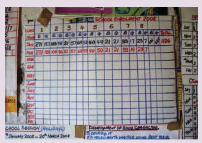
Photo of enrollment figures from the office of the head teacher in Golgota school.

This illustrates the disparity between the official statistics and the reality of educational marginalization for girls in rural Malawi. There is